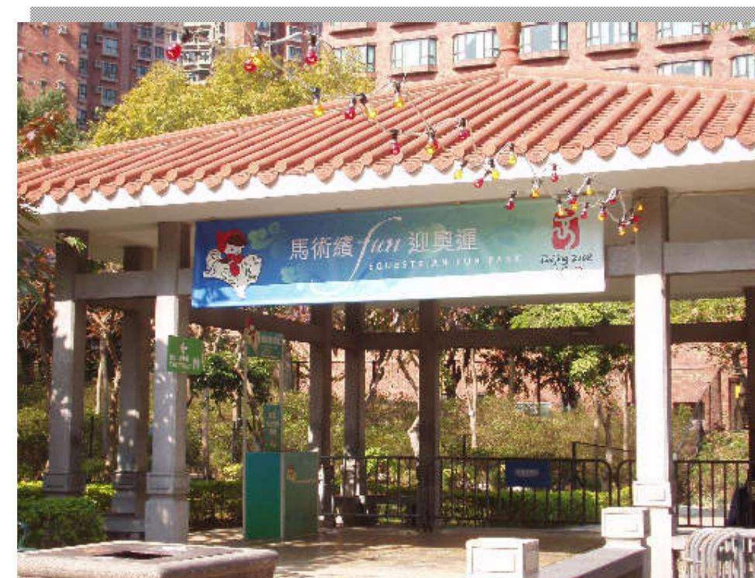
Decorations in the Park