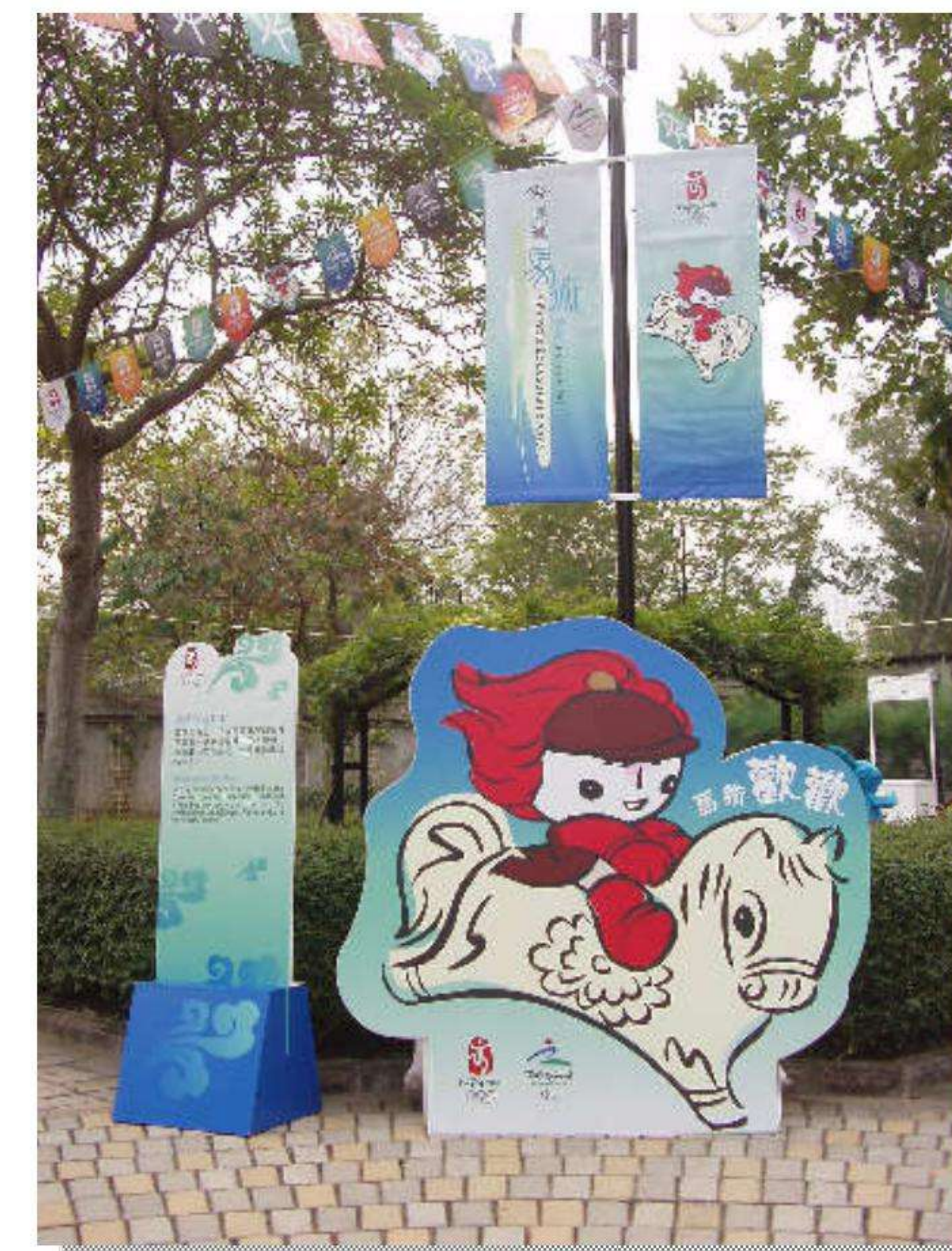
Decoration in the Park