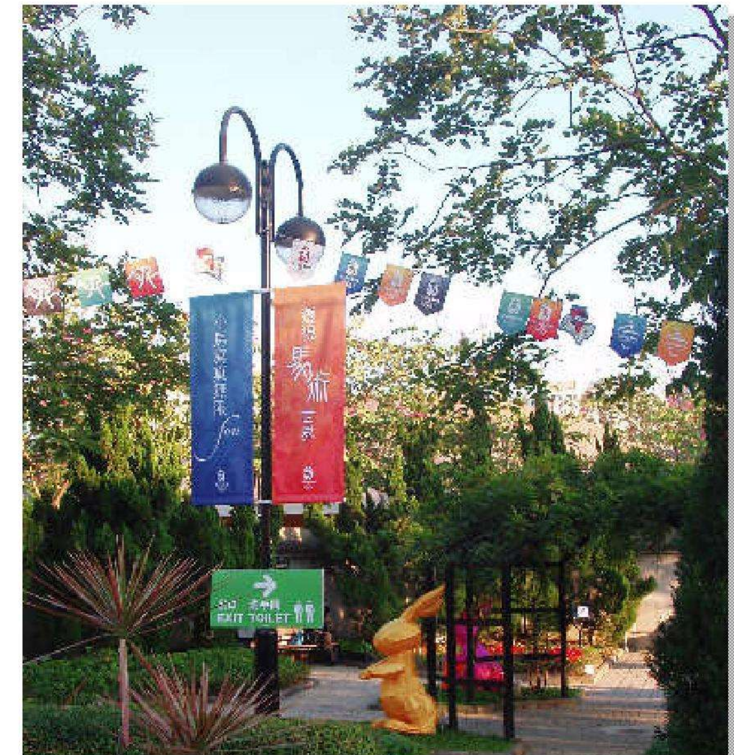
Decoration in the Park