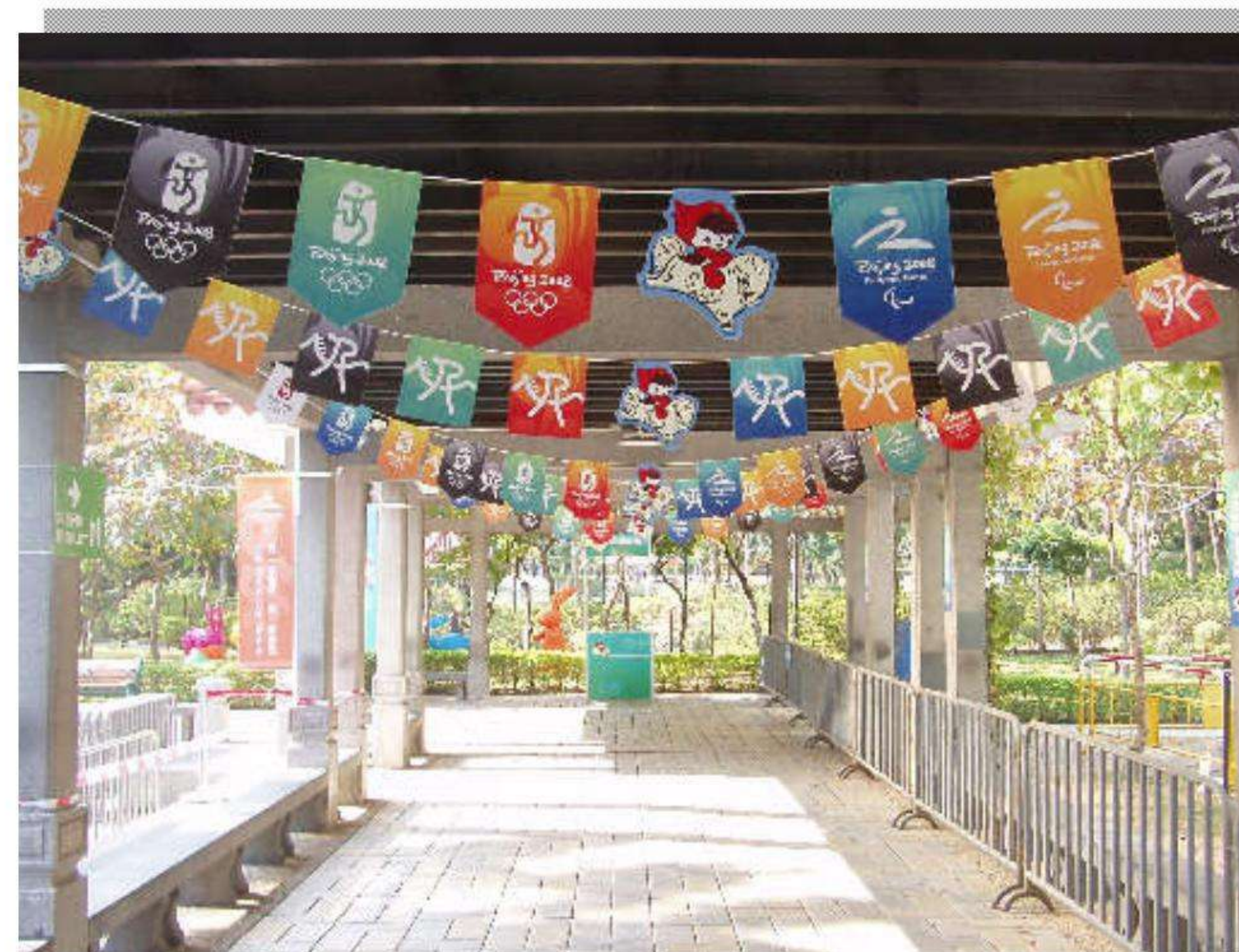
Decorations in the Park