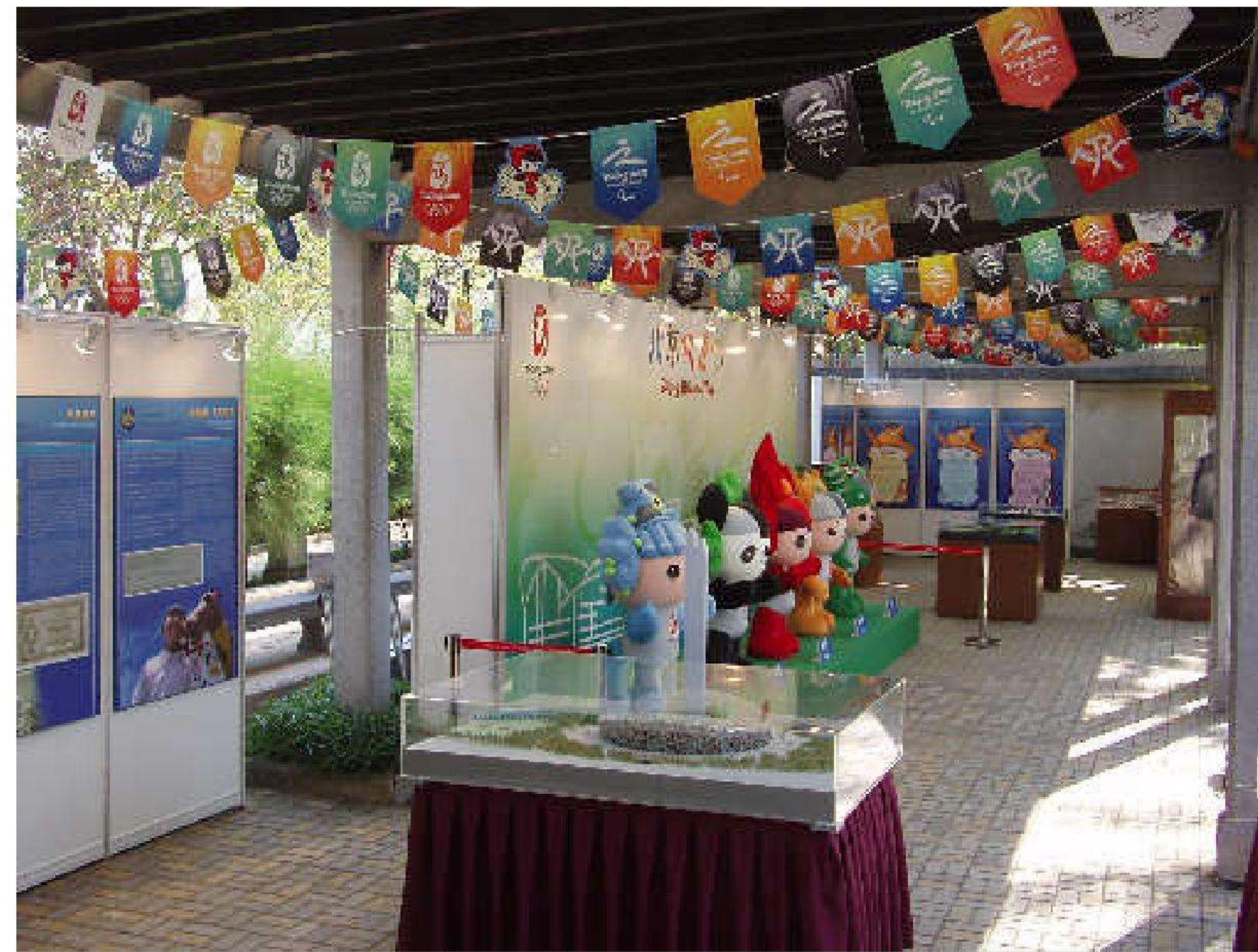
Decoration in the Park